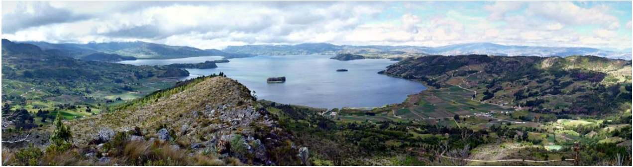
Lake Tota – The lake in the clouds , at 3015 m high in the Andes of Colombia.